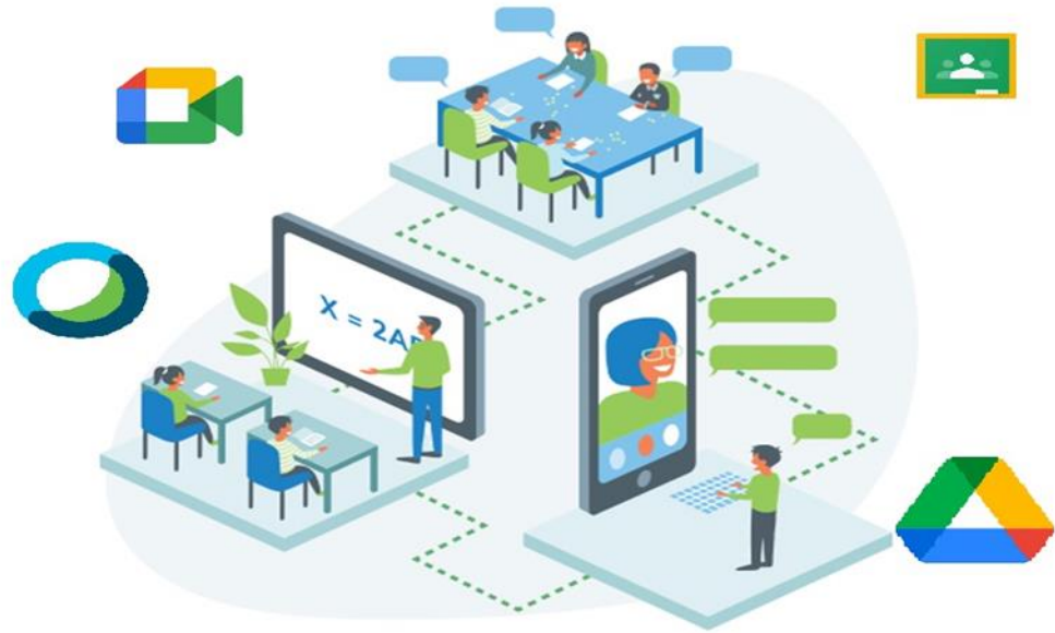
Fig. 3. Applications of Cloud Computing