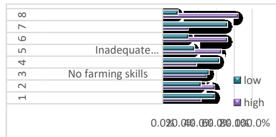
Figure 1 Barriers to implementation