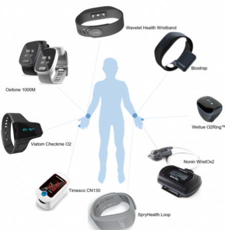
Figure 1: Commercially available wearable pulse oximeters

used organic photodetectors to demonstrate a polymer LED-based pulse oximeter.