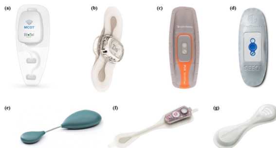
Figure 3: Commercial ECG patches used in clinical trials and in COVID-19

electrical and muscular function of the heart. ECG abnormalities.