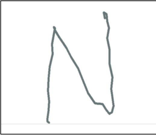
Fig. 4. Finger Tip tracking output