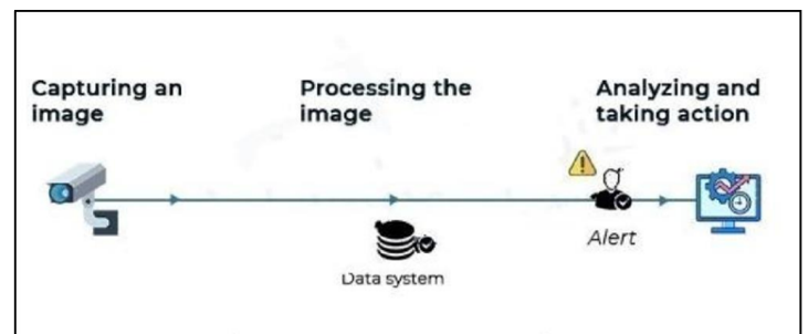
Fig. 1. Computer vision Process

The scientific discipline of computer vision primarily concerns the principles underpinning artificial systems designed to extract meaningful information from images. Image data can manifest in diverse formats, multiple camera perspectives, data from three dimension scanners, and medical imaging equipment. Computer vision, as a technical domain, strives to implement its concepts and frameworks in the advancement of computer vision systems.