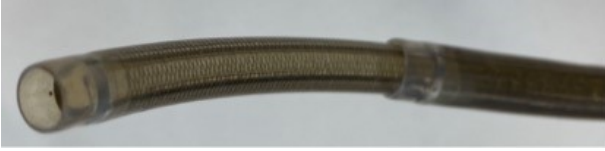
Fig. 1. Example tendon-actuated catheter comprised of two telescoping tubes.

While many of these devices are comprised of a single elongated tube, there are important clinical examples for which a single steerable tip section is insufficient and the increased steerability provided by additional telescoping steerable sections is needed (Fig. 1). For example, the delivery systems used for heart valve repair and replacement employ 2-3 tendon-actuated telescoping sections [1]. Additional examples include Hansen Medical's robotic electrophysiology catheter [2] and Auris Health's robotic endoscope for peripheral lung biopsies [3] each of which possess two telescoping steerable sections.