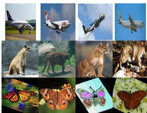
Figure 4. Some images from Caltech-101 Image Database for three categories ('airplanes', 'cougar_body', 'butterfly')

Caltech-101 Image Database [29] was also used for evaluation of the proposed technique. Figure 4 shows some images from the database.