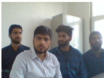
Figure 2. A frame from the benchmarking video

ROIs were extracted per frame, up to a maximum of four. Figure 3 shows the four ROIs extracted from a frame of the video.