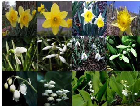
Figure 5. Some images from 17Flowers Dataset

17Flowers Image Database [30] was also used fully for evaluation of the proposed technique. Figure 5 shows some images from the database. All images in the available 17 categories were selected. The number of images for each category in the database is 80. For experimentation the images were randomly selected with 70% of images (i.e. fifty-six images) for training and 30% of images (i.e. twenty-four images) for testing per class. The results of the experiments are shown in Table 4.