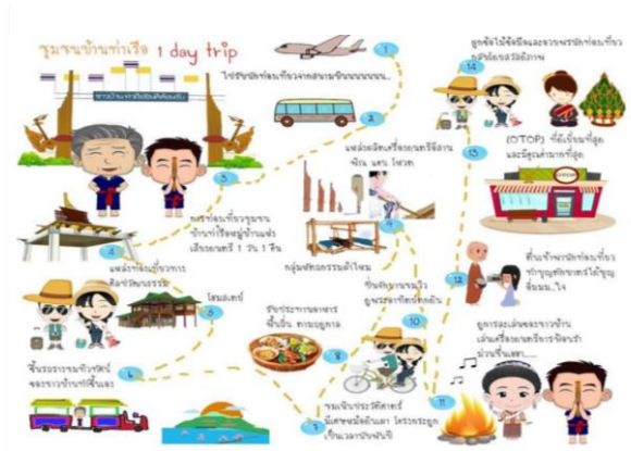
Figure 7. 1 day trip on map