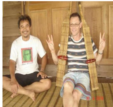
Figure 4. Tourists learn how to play Khaen.