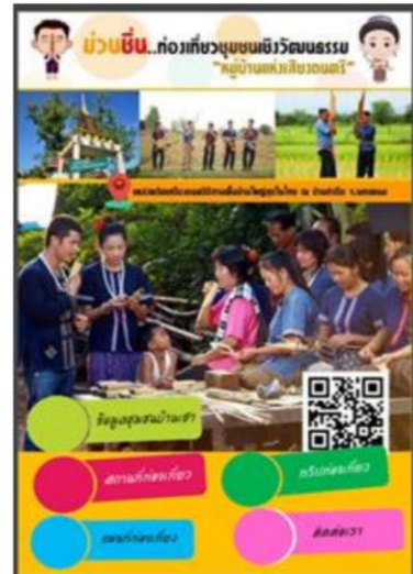
Figure 5. Operation menu page of AR