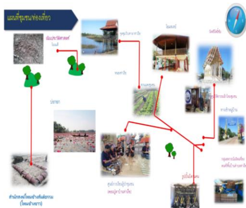
Figure 6. tourist map