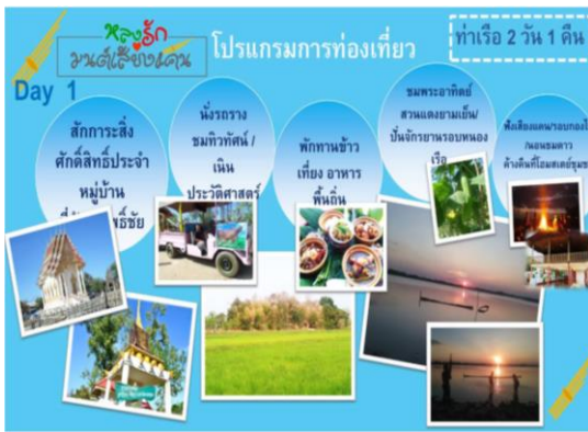
Figure 6. tourist attraction In the Na Wa community area one day trip