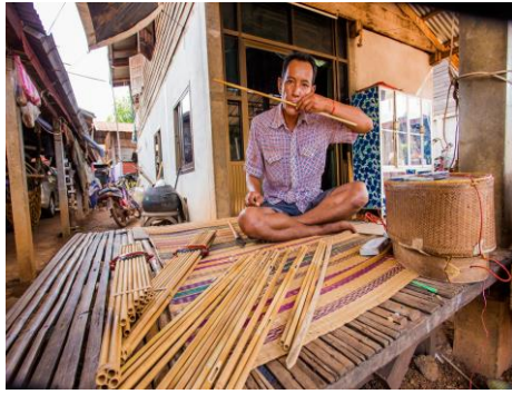
Figure 1. making Isan musical instruments of people in the community