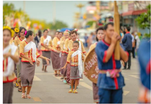
Figure 2. Community arts and culture.