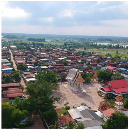
Figure 3. community scenery