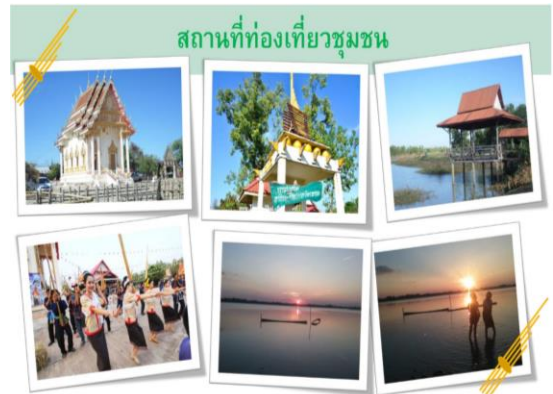
Figure 7. tourist attraction In the Na Wa community