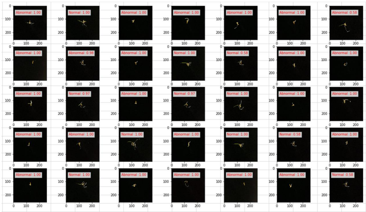
Figure 6. Test results