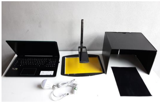
Figure 3. Picture of instruments used for collaborating and taking pictures.