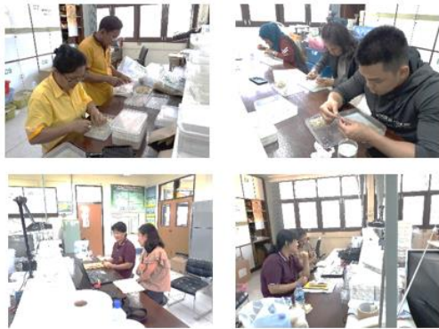
Figure 4. Image data collection by experts.