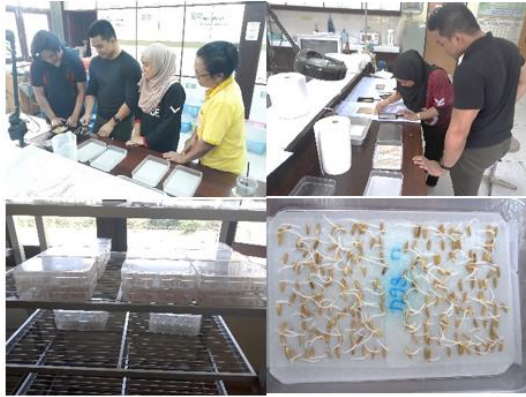
Figure 2. Seeds cultivation germination process.

Figure 2 is the activity of how the seeds are cultivated and germinated. The first row shows the activity of our experts and their assistants evaluate the seeds and the second row is how the seeds were stored.