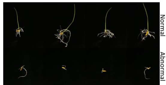
Figure 1. Sample normal and abnormal images.

We obtained images from seeds cultivation in the seed laboratory of the Surin Rice Seed Center, Surin Province. We collected sets of seeds randomly from seed group. Then, we cultivated the seeds and stored in the normal environment room with normal light, and kept the seeds to grow for a period of 7 days.