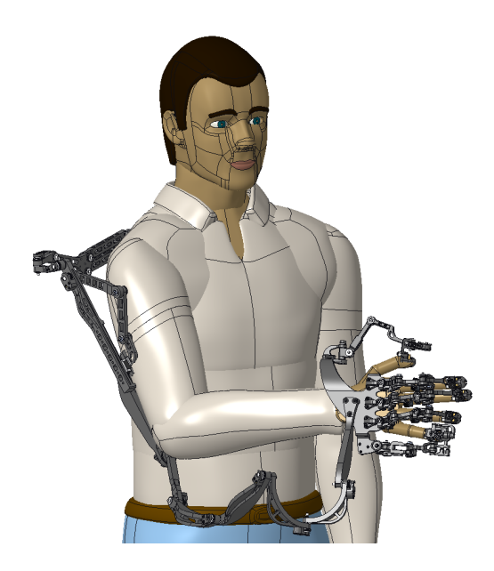
Fig. 1. CAD view of the wearable mechanical upper limbs-tracking system endorsing serial kinematic chains for precise hand dorsum pose estimation.

* corresponding author: marcello.palagi@santannapisa.it We acknowledge the support of the European Union by the Next Generation EU project ECS00000017 'Ecosistema dell'Innovazione' Tuscany Health Ecosystem (THE, PNRR, Spoke 4: Spoke 9: Robotics and Automation for Health). Moreover, the publication was created with the co-financing of the European Union - FSE-REACT-EU, PON Research and Innovation 2014-2020 DM 1062 / 2021.