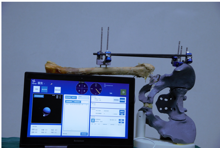
Figure 1 The sawbone hip construct and Inertial Measurement Unit based Hip Smart trial system ( IMUHS ) in neutral position

To simulate the total hip arthroplasty, we employed a radiopaque sawbone pelvis and femur, implanted a 60 mm trial cup into the right acetabulum after reaming, and a trial femoral stem into to the femoral canal after broaching using surgical instrument ( Depuy, Warsaw, IN). The IMUHS 36 mm diameter trial head was then assembled onto the femoral trial.