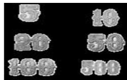
Figure5: Extracted Image