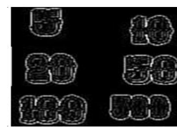
Figure6: Filter Image