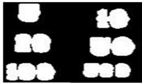
Figure4: Segmented Image