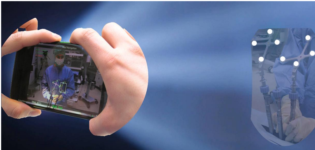
Figure 1: System for rod determination

The hardware of the rod determination system consists of Aescuclap's S4 Element® pedicle screw system for MIS TLIF surgery with special adapters for two different Rigid Bodies with retro reflective markers and a medical mobile localizer with a custom developed application. The medical mobile localizer detects the retroreflective markers of the Rigid Bodies and calculates the position of the pedicle screw heads, which the Rigid Bodies are attached to like presented in Figure 1. For the measurement of the positions one pedicle screw is fixed and serves as a reference screw. During the whole recording a non-movable Rigid Body is positioned on the top of the reference screw's downtube. Further, three remaining pedicle screws are localized with the mobile Rigid Body attached to them. During the recordings the mobile Rigid Body is moved from the nearest to the furthest positioned screw with regard to the fixed screw.